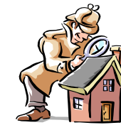
Independent Home Inspection Service